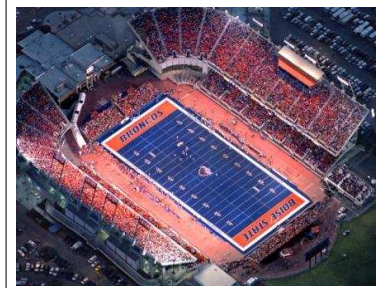
Boise State Stadium

HURRY UP & REGISTER for the IAHU Awards Banquet & Symposium at www.iahu.org